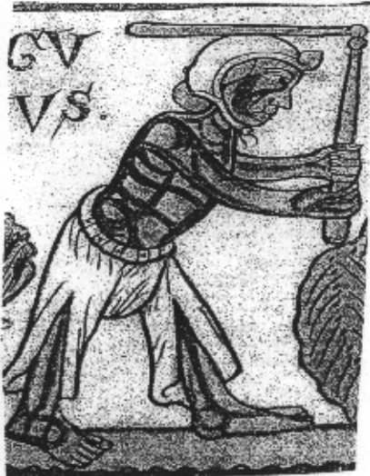
13 th C. Braies w/ legs split in the front.